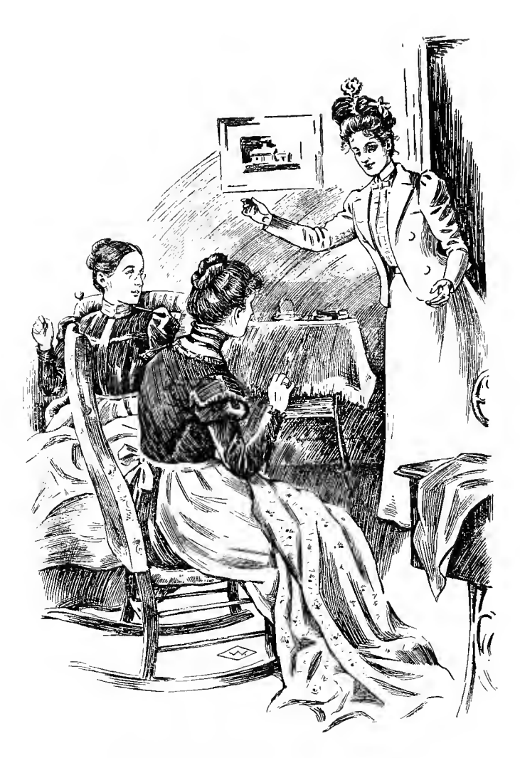
A Rosy Young Woman Sprang In Upon Them.